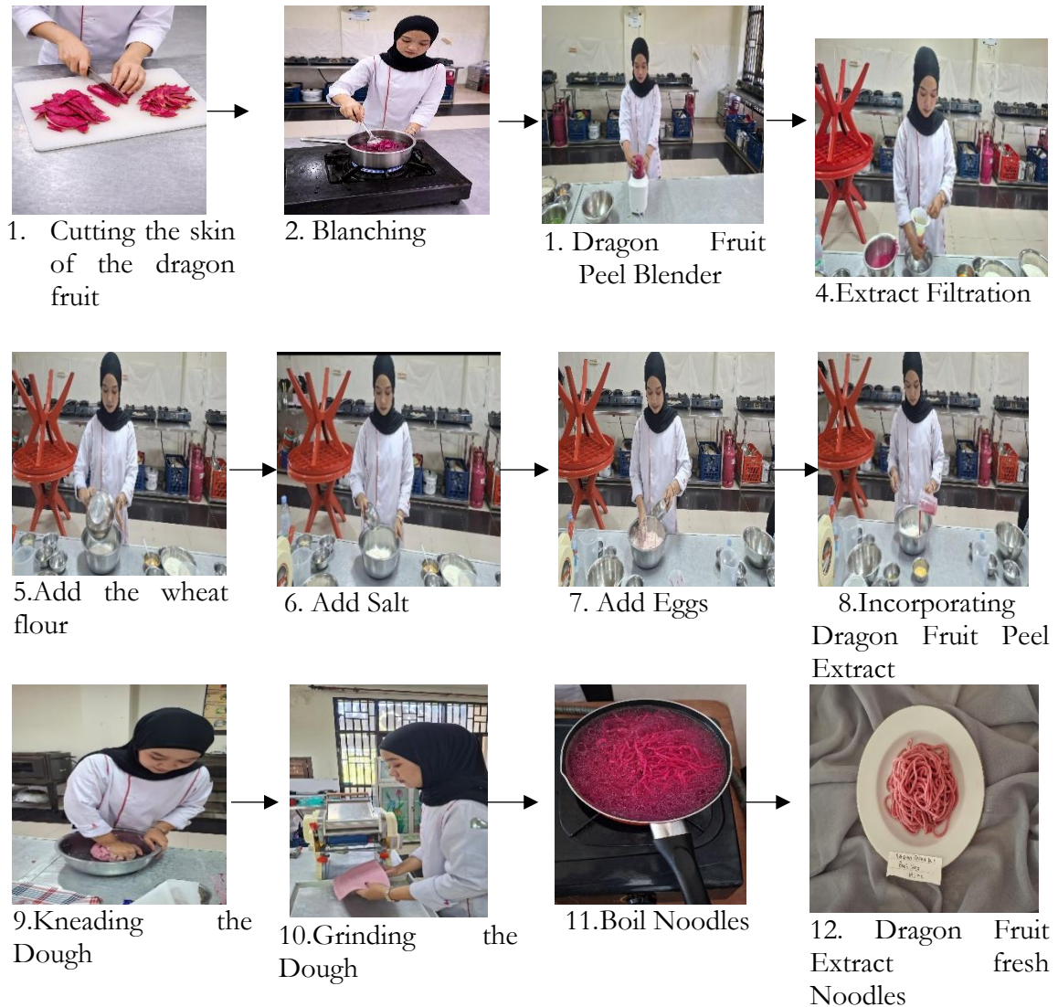
Figure 1. Research Stage Process of the Effect of Red Dragon Fruit Peel Extract Substitution on the Sensory Quality of Fresh Noodles

The stages or procedures for producing fresh noodles with the substitution of red dragon fruit peel extract are illustrated in the research process diagram shown in Figure 1.