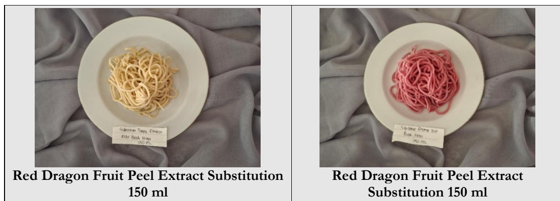
Figure 3. Visual Comparison of Fresh Noodles Without Substitution and with Red Dragon Fruit Peel Extract Substitution 150 ml

To further substantiate the sensory data analysis results, a visual comparison of the two fresh noodle products is presented in Figure 3.