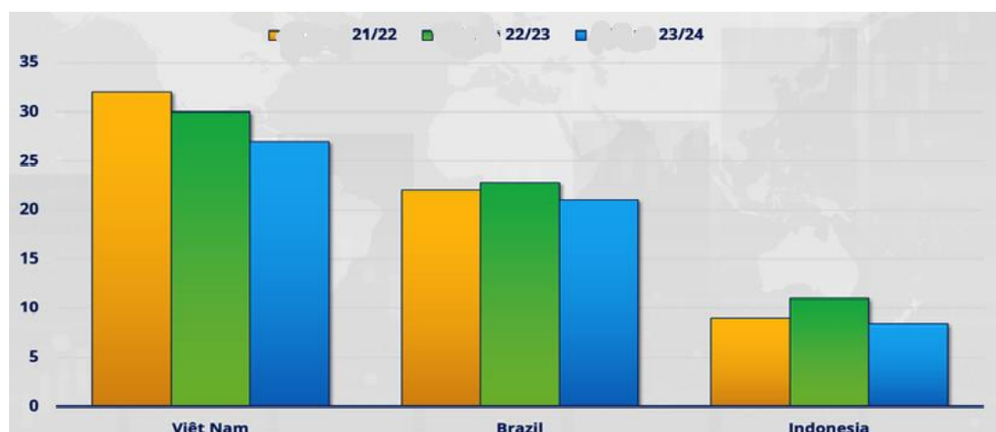
Figure 3: Estimated coffee production of 3 countries

Compared to the beginning of 2023, the domestic coffee price as of January 17 is nearly double the price of 39,000 VND/kg. Moreover, Robusta prices on the world market also increased by about 80% compared to when the price reached 1,900 USD/ton at the beginning of last year. Coffee prices in the first half of 2024 are expected to stay at a high level, which is a relatively good stepping stone for the target of coffee export value exceeding 4 billion USD for the third consecutive year.