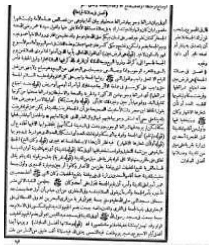
Figure 1 Learning materials for Fiqh meeting 16