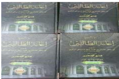
Figure 4 The Book of Fiqh I'Anatu Ath-Tholibin Volume 1,2,3 and 4

Informant IV's statement above about the book used by teachers at Islamic boarding schools is supported by an interview with informant I, on Wednesday, January 5, 2022 that: "The study of the yellow book that is studied at the Waratsatul Anbiya Islamic Boarding School at the Madrasah Aliyah level is the book I'anatu AthTholibin volumes 1,2,3 and 4. Class X uses Book I ' anatu AthTholibin volumes 1 and 2, Class XI Volumes 2 and 3 and Class XII Volumes 1 and 4 "