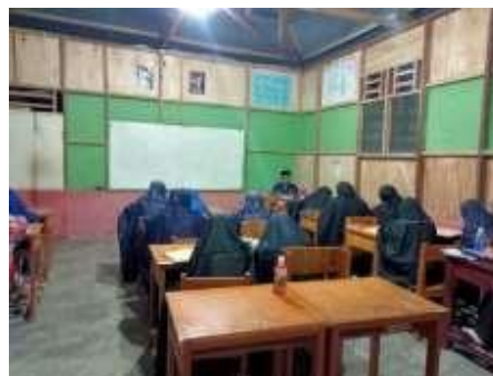
Figure 3 Observation of Jurisprudence Learning Activities in the Evening Class

"In learning the yellow book, learning Fiqh uses a variety of methods, now the ustadz is reading it and the students are listening and the students are asked to repeat the book that was studied, there are also methods using discussions or groups where students are assigned to study the book first. by asking seniors, and the next night the students appear in front of the class delivering material according to their respective group assignments, and there is also another method, namely by reading sentences directly interpreted and translated. And later asked students to repeat directly. We, as cottage teachers, do not make lesson plans except general teachers.