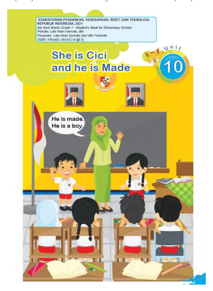
Figure 1. Picture for the story

The growing concern on TEYL is also a rich land for publishers and book writers. Therefore, it is now very easy to get teachers' resource books available everywhere. The books are also equipped with lesson plans which would be very useful for teachers in developing their activities. Here are samples from My Next Word Grade 1 - Student's Book for Elementary School (2021) dan Teacher's Book – My Next Words Grade I (2021):