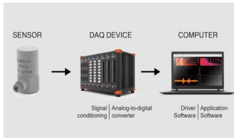
Figure 1: Data Acquisition Device

In the context of a Hybrid PV-Wind System, integrating a Data Acquisition System (DAQ) is crucial for real-time monitoring and effective management of system performance. The DAQ enables the collection of important environmental data (such as solar irradiance, wind speed, temperature, and humidity), as well as energy consumption data (load profiling). This real-time data helps in optimizing the operation of the hybrid system and ensures its efficiency, reliability, and sustainability. Let's break down the key components and terms involved in this process: