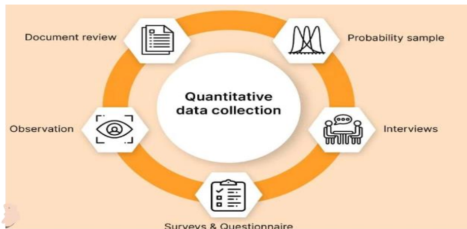
Figure 3: Quantitative and Qualitative Data Collection