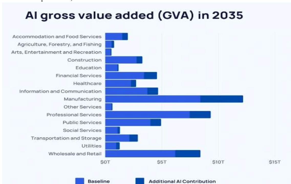
Figure 2: Artificial Intelligence Statistics

The adoption of AI is also evident in the widespread use of AI applications. For instance, a survey conducted by PwC (2020) found that 52% of companies have already adopted AI in some form, with an additional 30% planning to do so in the next coming years. This widespread adoption is attributed to AI's ability to enhance operational efficiency, improve customer experiences, and drive innovation.