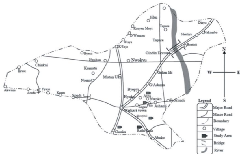
Figure 2: Map of Wukari Local Government showing the study area. (GIS LAB MAU)